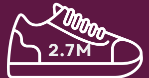
Clothing & Footwear Units