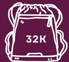
# Care Packs