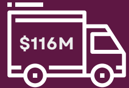
Value of Goods & Food

Distributed to Date since our founding in 2017